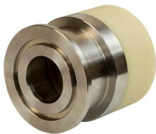
H1 KF-40 Sensor Housing