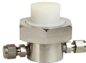
H3 Flow Throw Sensor Housing