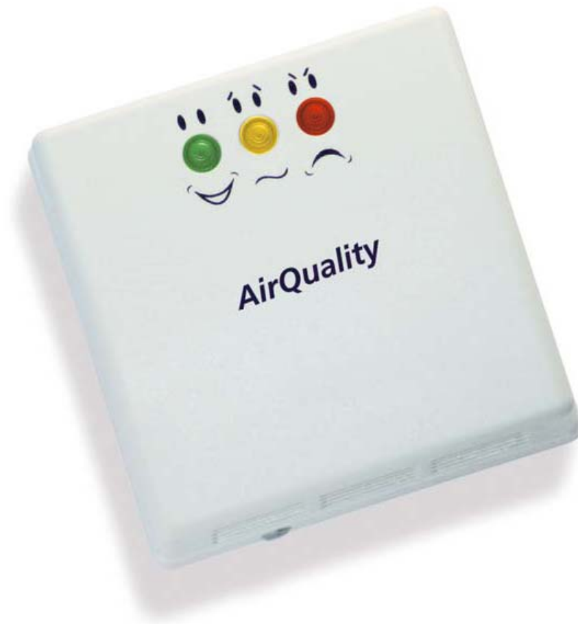
Fig. 1: AQ-CONTROL gas measuring system.

The two-beam infrared sensor is mounted on a sensor holder in a plastic housing over a diffusion opening. The plastic housing also contains the transmitter that processes and evaluates the measurement signals, two independent relay outputs, as well as three LEDs (green, yellow, red) for visual display of the measured values (see Fig. 1).